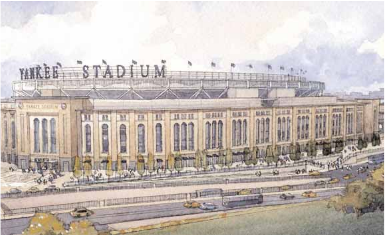
Architectural renderings of the new Yankee Stadium, above, in the Bronx, NY, and the new Mets ballpark, Citi Field, in Flushing, NY. United Spinal's Accessibility Services division was awarded contracts to ensure accessibility for all fans at both new facilities. The parks are scheduled for completion by Opening Day, 2009.