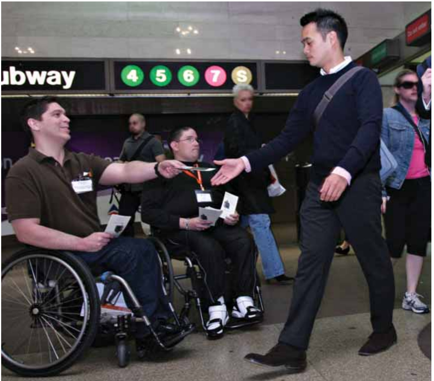
United Spinal members greet commuters and distribute informational material to raise awareness on SCI/D.